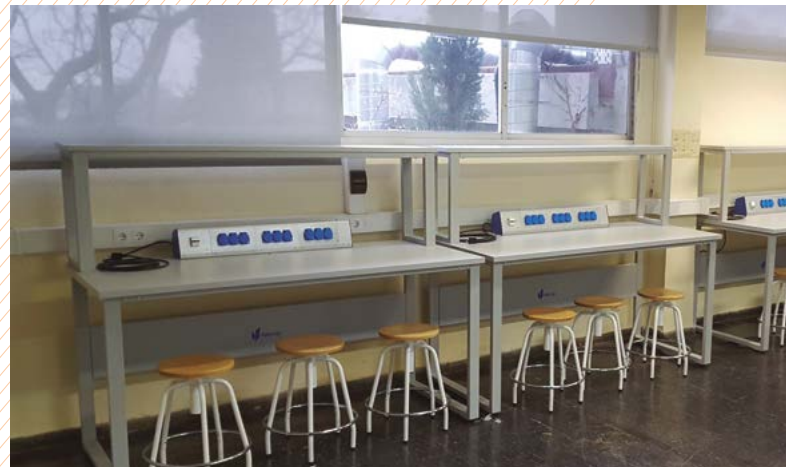
Computer Classroom. CIFO LA VIOLETA – CATALONIA