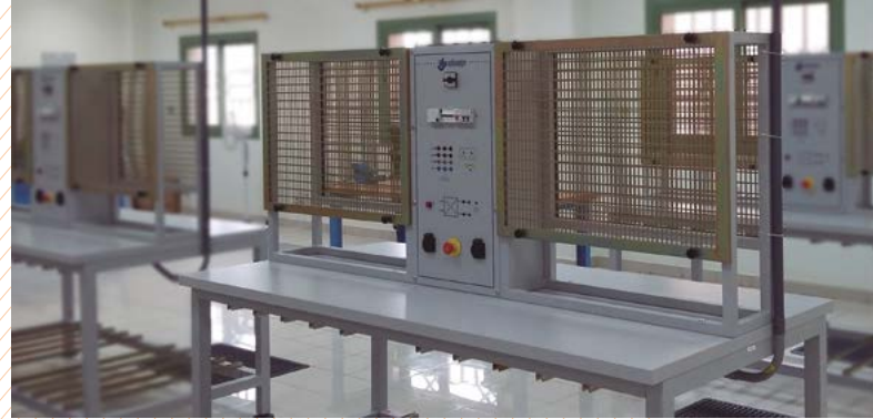
Electrical Installation Laboratory. COE MUHAYIL – ARABIA SAUDI