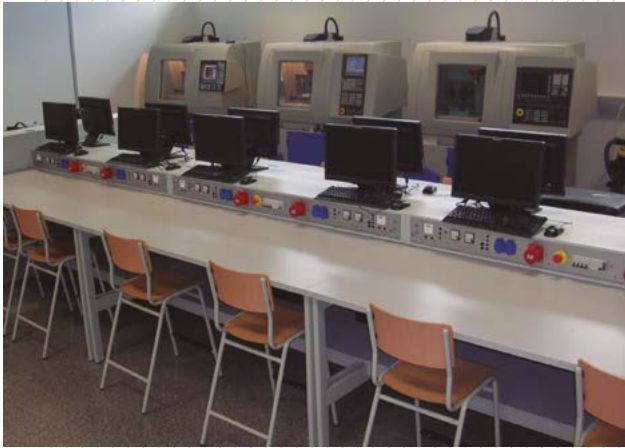
Numeric Control Laboratory. Metal Business Federation. MURCIA