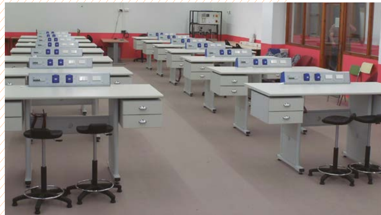
Electricity Classroom. ESCOLA FONSECA BENEVIDES – PORTUGAL