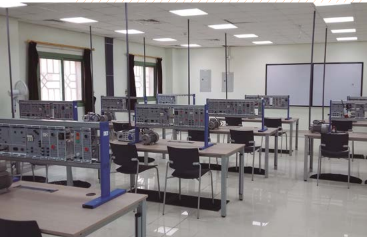
Electrical Automation Classroom. COE ASIR – ARABIA SAUDI