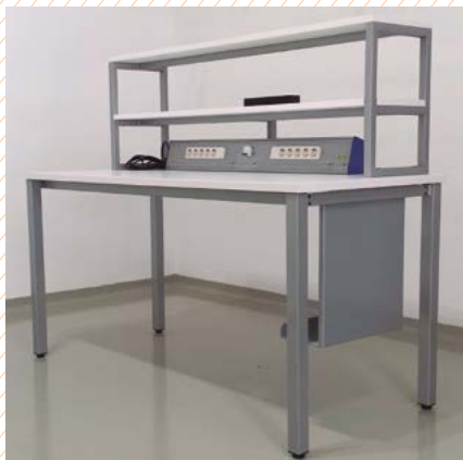
Computer Table. SCHOOL PARK. PORTUGAL